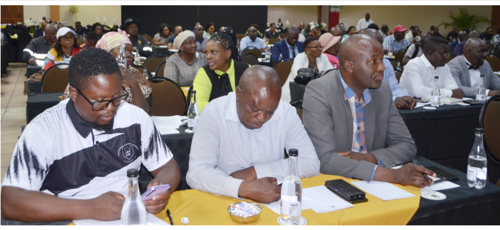
Members of MPACs attending the meeting.