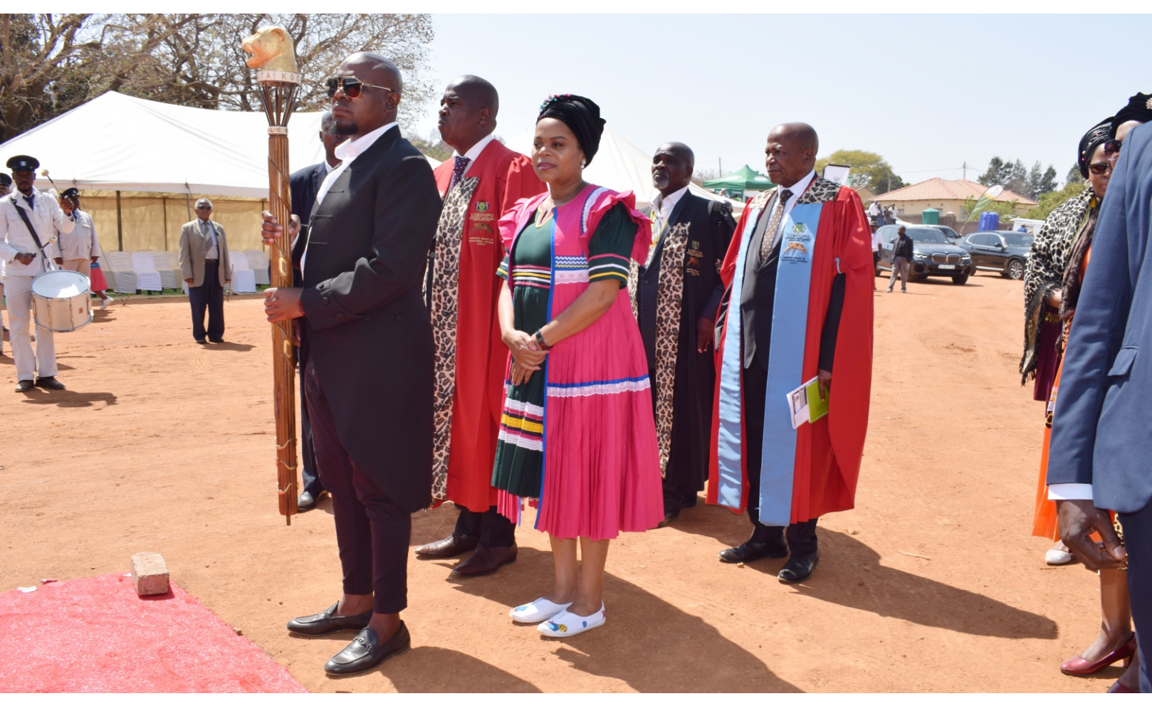
Sergeant at Arms leading the procession into the chamber during the opening of the Limpopo House of Traditional and Khoi-San Leaders.